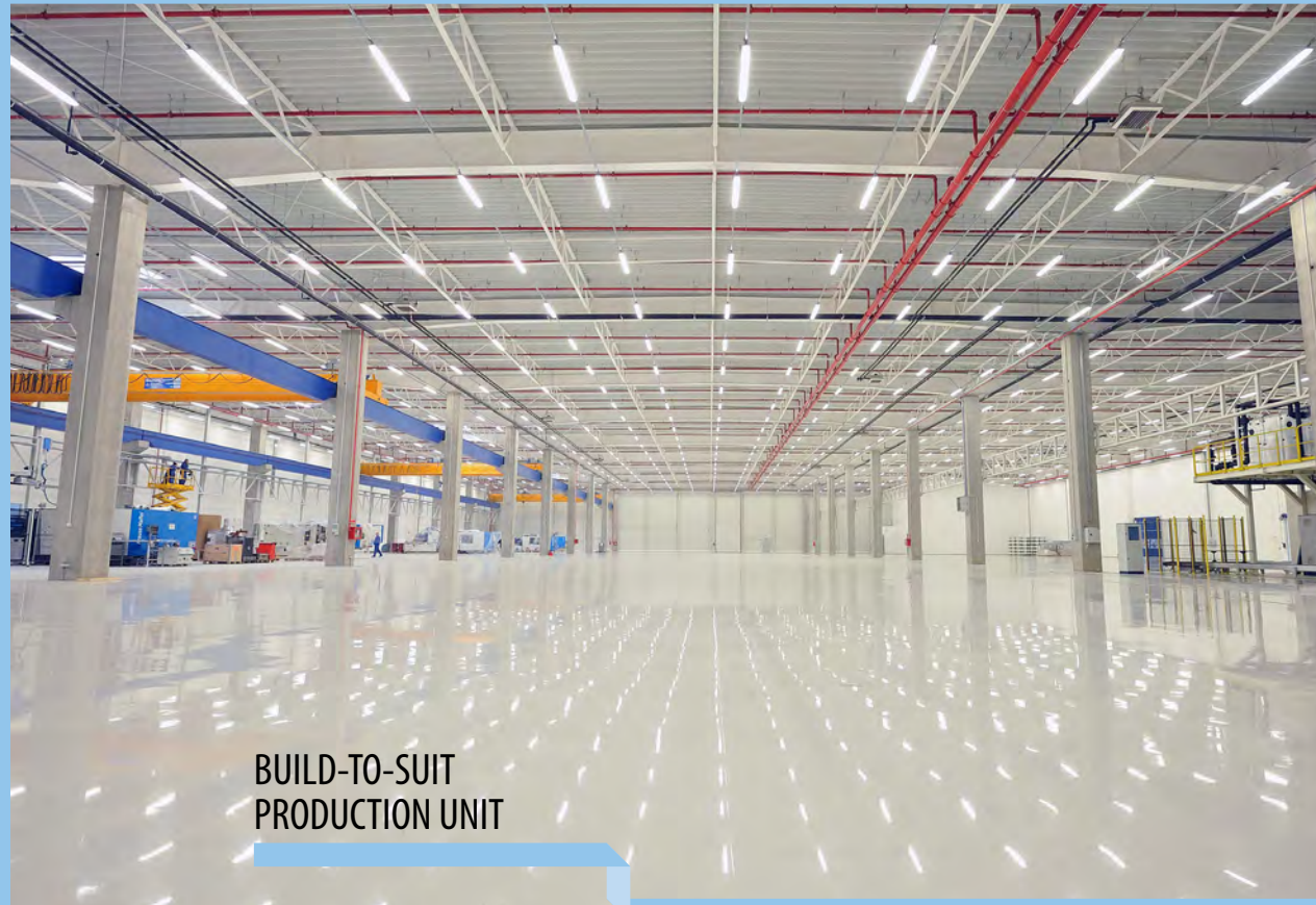
BUILD-TO-SUIT PRODUCTION UNIT

We are continuously developing our project for all existing customers and we welcome the opportunity to partner with new companies as well.